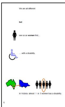
Training materials - Women with Disability

It would be useful if you had access to a laptop for the 2 day workshop.