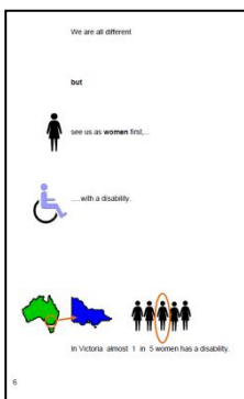
Training materials - Women with Disability

It would be useful if you had access to a laptop for the 2 day workshop.